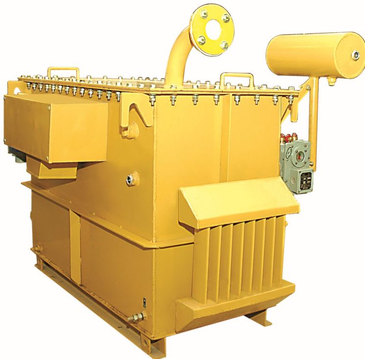
63 kVA transformer for drilling rig duty