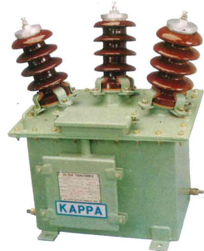
VAO - 133 - 01 (Max.Weight - 85 Kgs.)

36/70/170 kV single pole oil immersed VT