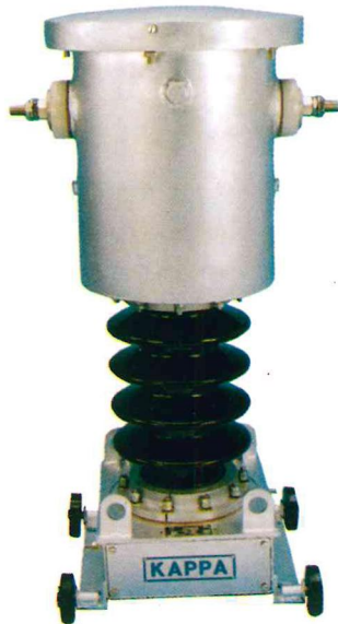
Model 4482 CW710