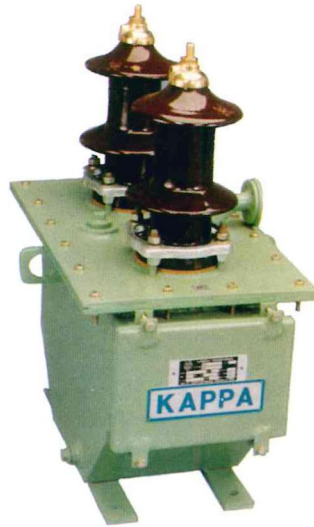
TYPE : VEO - 113 - 02