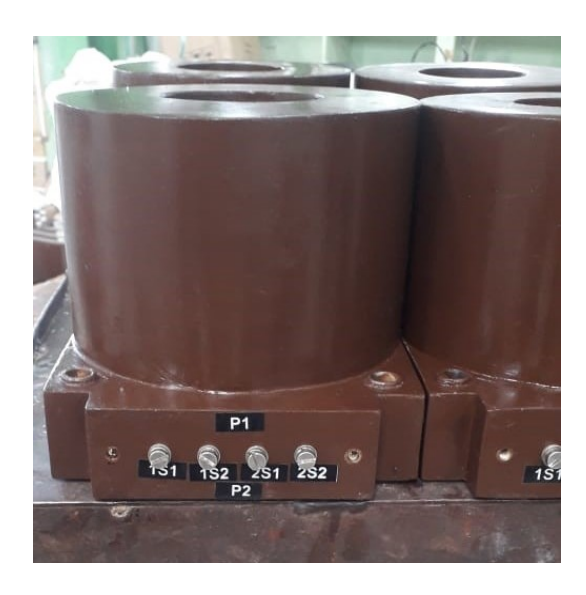
Wall bushing CT \uparrow

100A multi-core CT for use over bushing \rightarrow